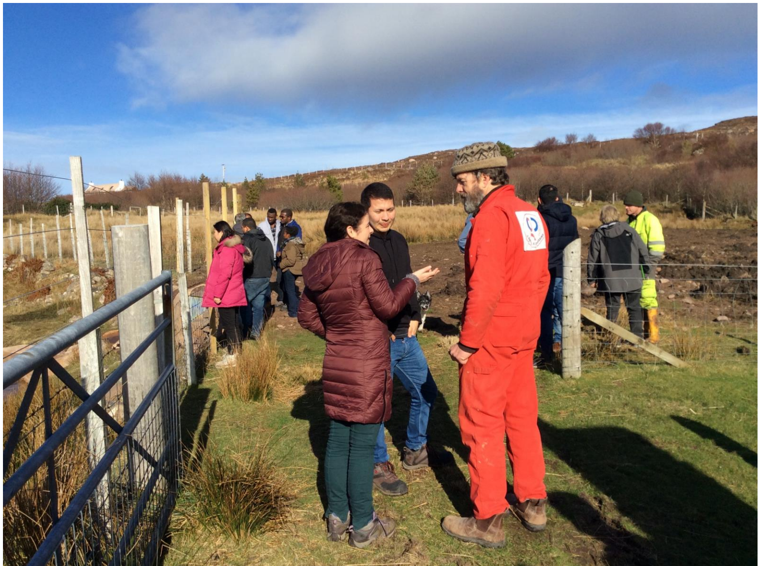
Ben Mor Hydro, Flensburg Uni Student visit