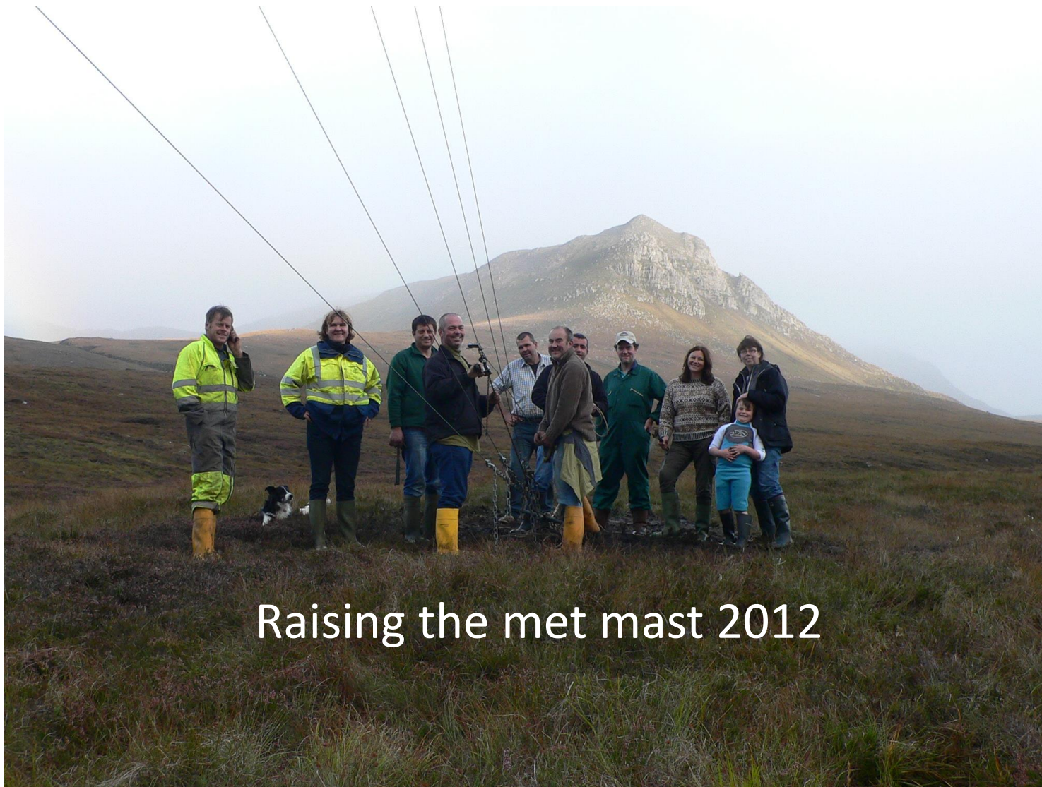
Raising the met mast 2012