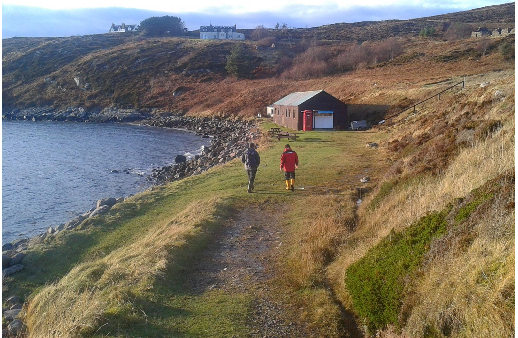
Isle of Tanera Mor Consultant visit, January 2013