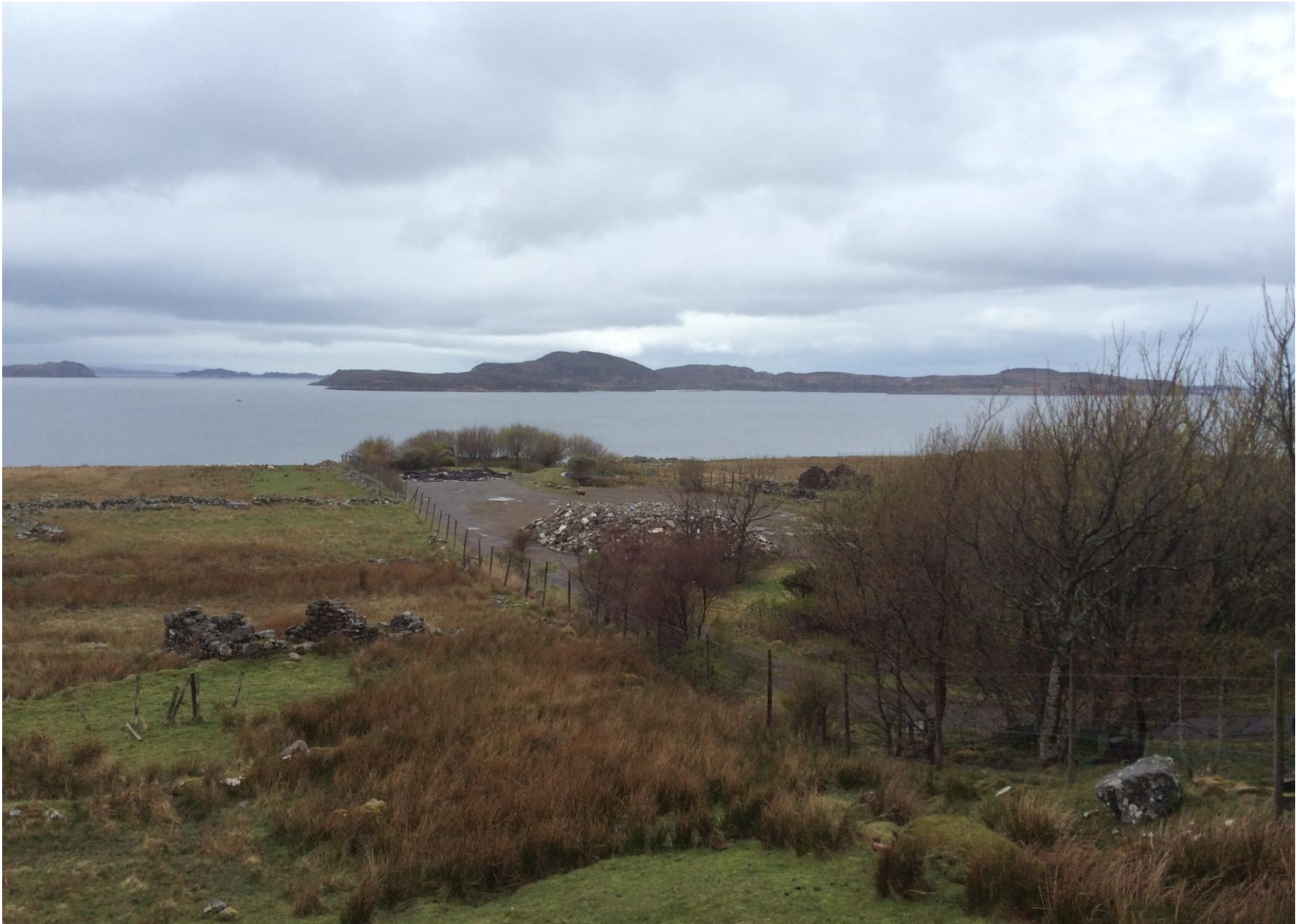
Achiltibuie Hydroponicum Site 2015...