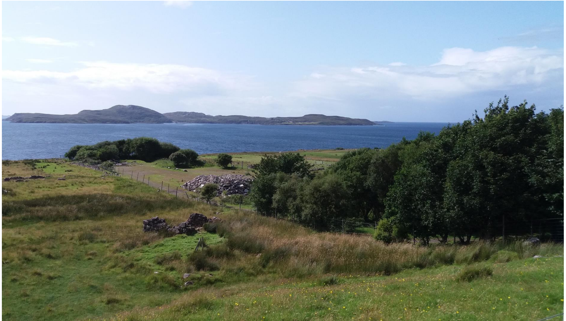
Achiltibuie Hydroponicum Site 2019