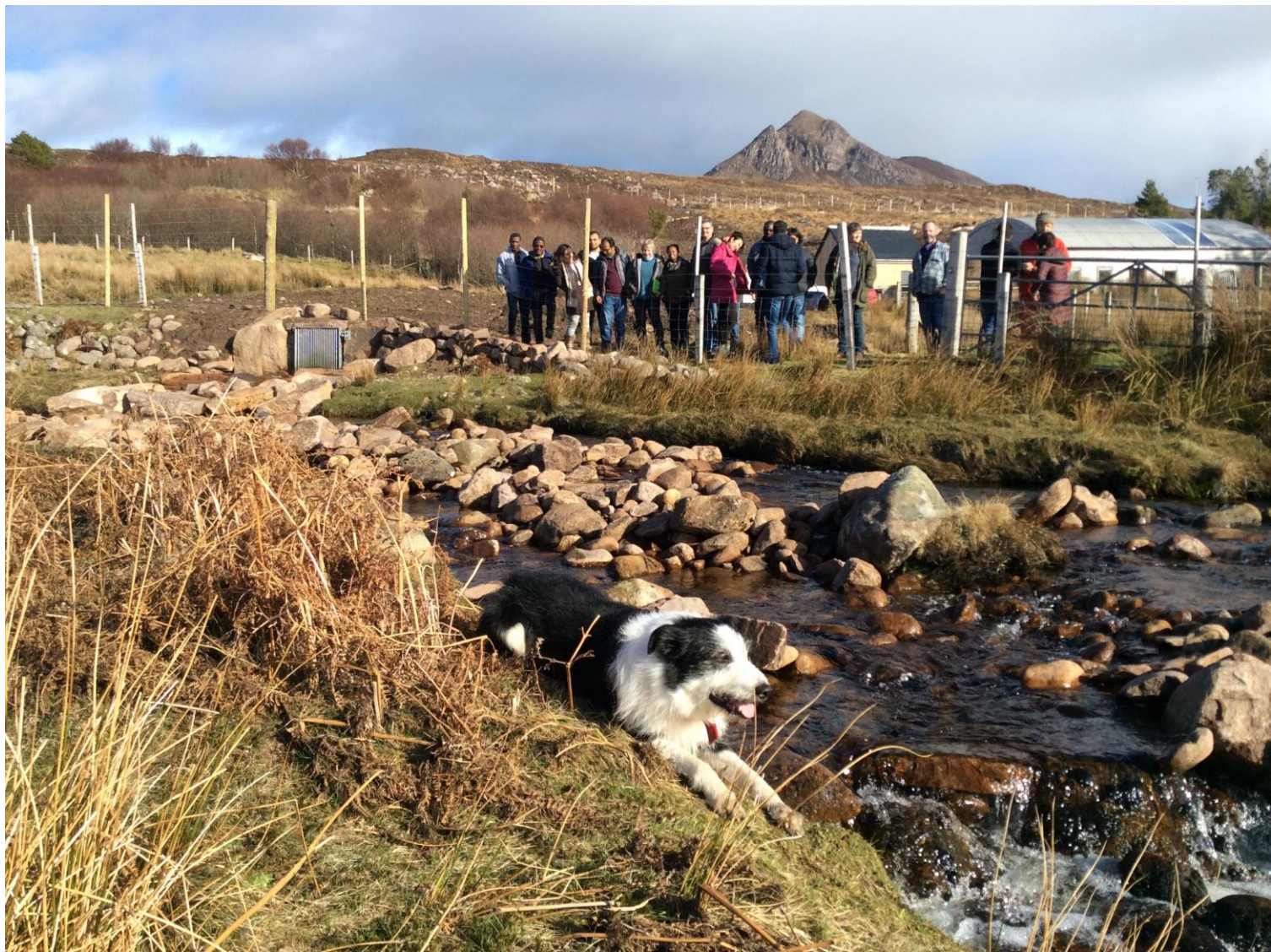
BMH, Scout and the Acheninver Burn