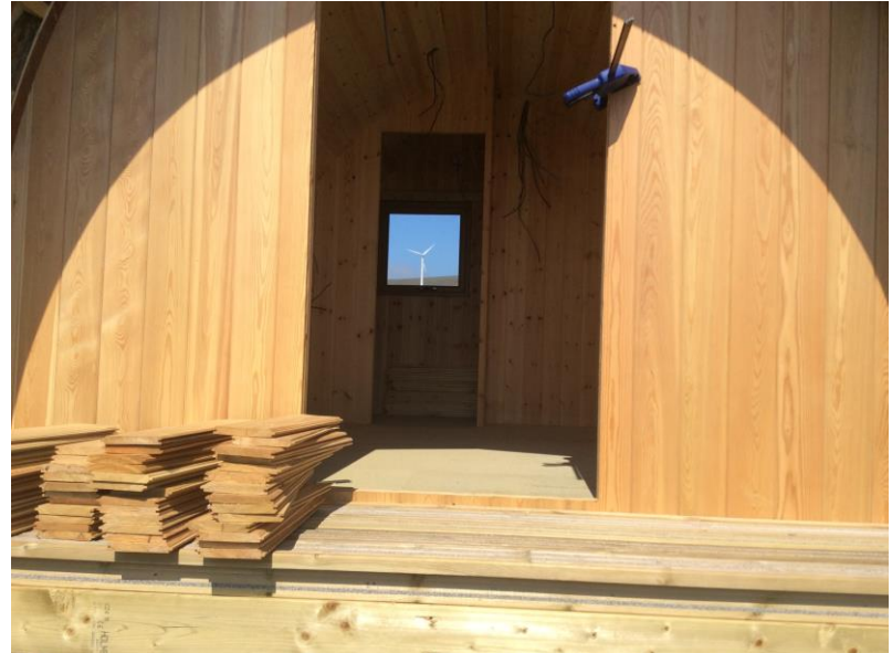
Hostel pods 2016