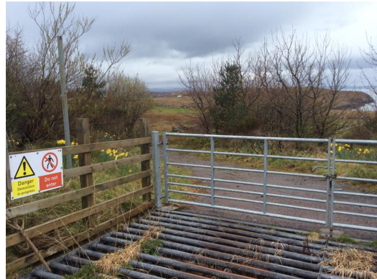
Achiltibuie Hydroponicum 2011