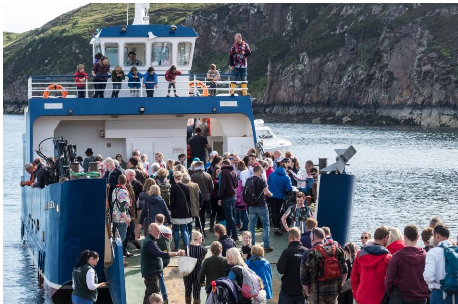
Open Day 2019