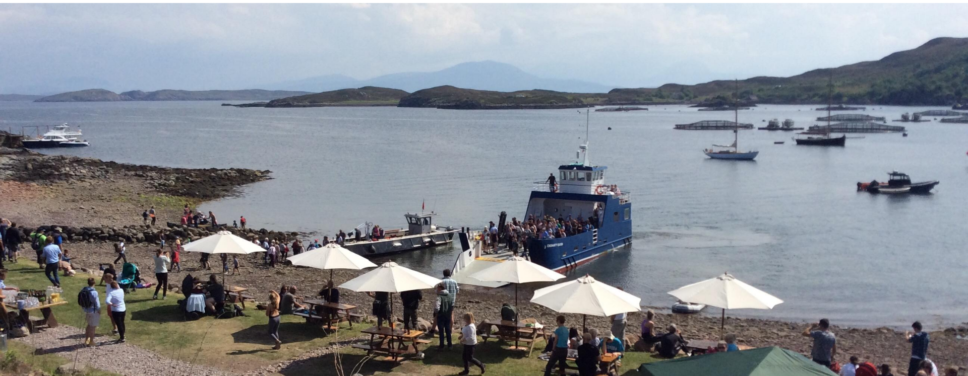
Tanera Open Day June 2019