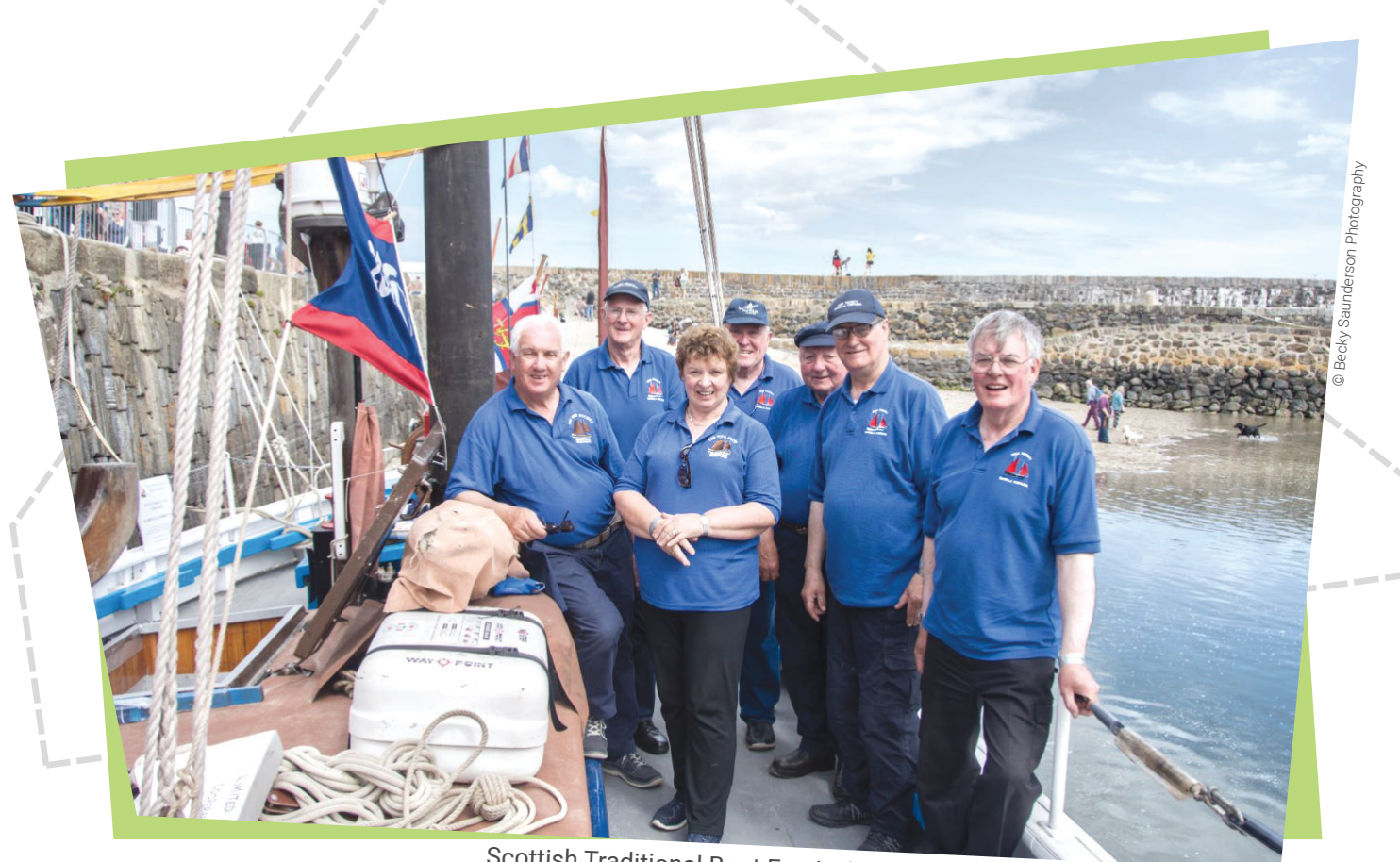
Scottish Traditional Boat Festival organised by Portsoy Community Enterprise